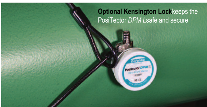
Optional Kensington Lock keeps the PosiTector DPM L safe and secure

Operating Range: -40° to 60° C (-40° to 140° F)