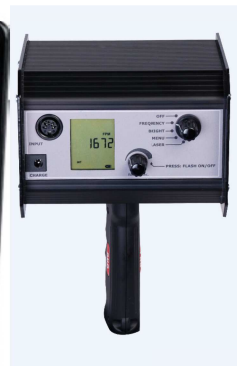
Simple controls and bright, easy-to-read LCD display.