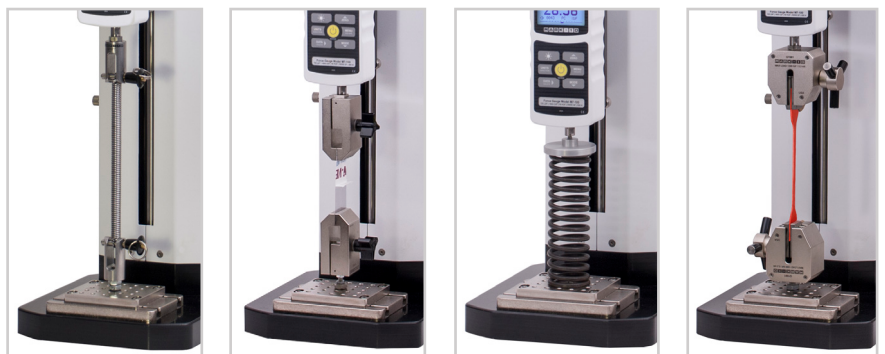
> Typical applications (l to r): extension spring testing, peel testing, compression spring testing, tensile testing