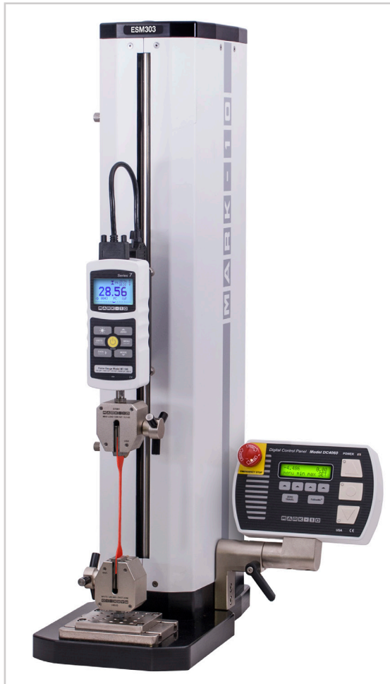
^ ESM303 is shown above configured for a tensile test, with a Series 7 force gauge and G1061-2 wedge grips.

The ESM303 is a highly configurable single-column force tester for tension and compression measurement applications up to 300 lbf [1.5 kN], with a rugged design suitable for laboratory and production environments. Sample setup and fine positioning are a breeze with available FollowMe™ force-based positioning - using your hand as your guide, push and pull on the force gauge or load cell to move the crosshead at a variable rate of speed.