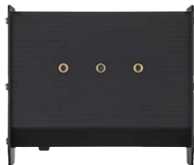
Three Threaded Mounting Holes (1 @ 1/4 - 20, 2 @ M5 on underside)