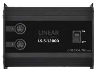
Control Panel with input/output ports