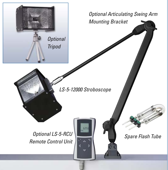
Optional Articulating Swing Arm Mounting Bracket