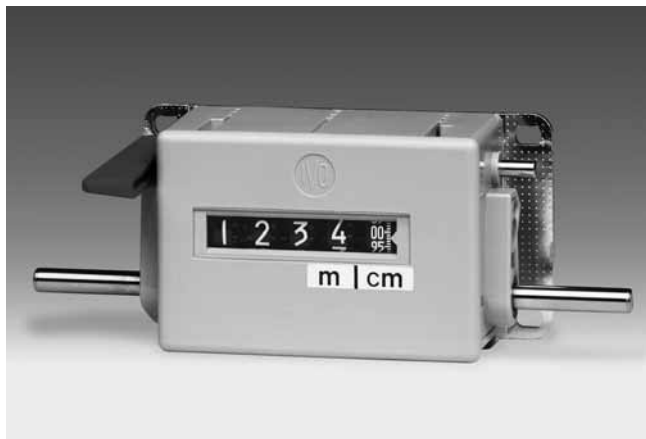
M 410.A - PTB Meter counter